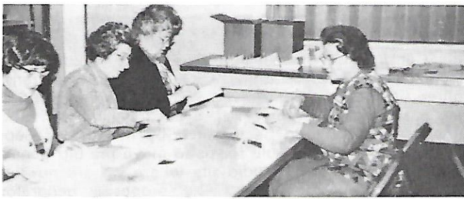
Ladies from First Covenant Church in Willmar, MN affixing mailing labels to Call Letter