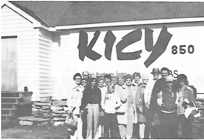
Part of Covenant Tour Group outside KICY Studio