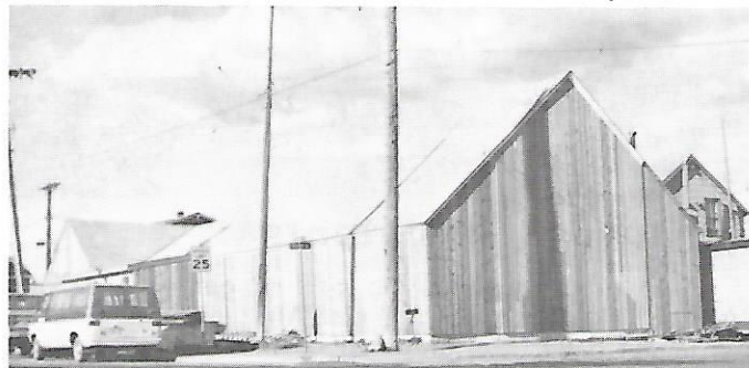
Nome Covenant Church remodeling nears completion

KICY's new 1976 Chevrolet crew cab arrived safely in June on the first barge of the summer. We are thankful to have sold the old crew cab at a good price.